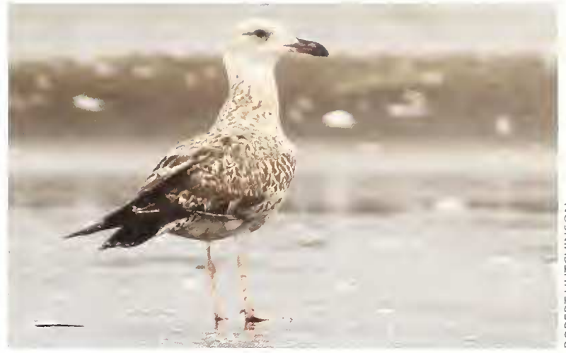
Plate 10. Lesser Black-backed Gull Larus fuscus , Tibsoc, Negros Occidental, 5 January 2014.